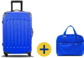
To be dropped at Bag Drop desk

You can bring: 1 small bag + 1 x 10kg Check-in Bag (that fits under the seat).